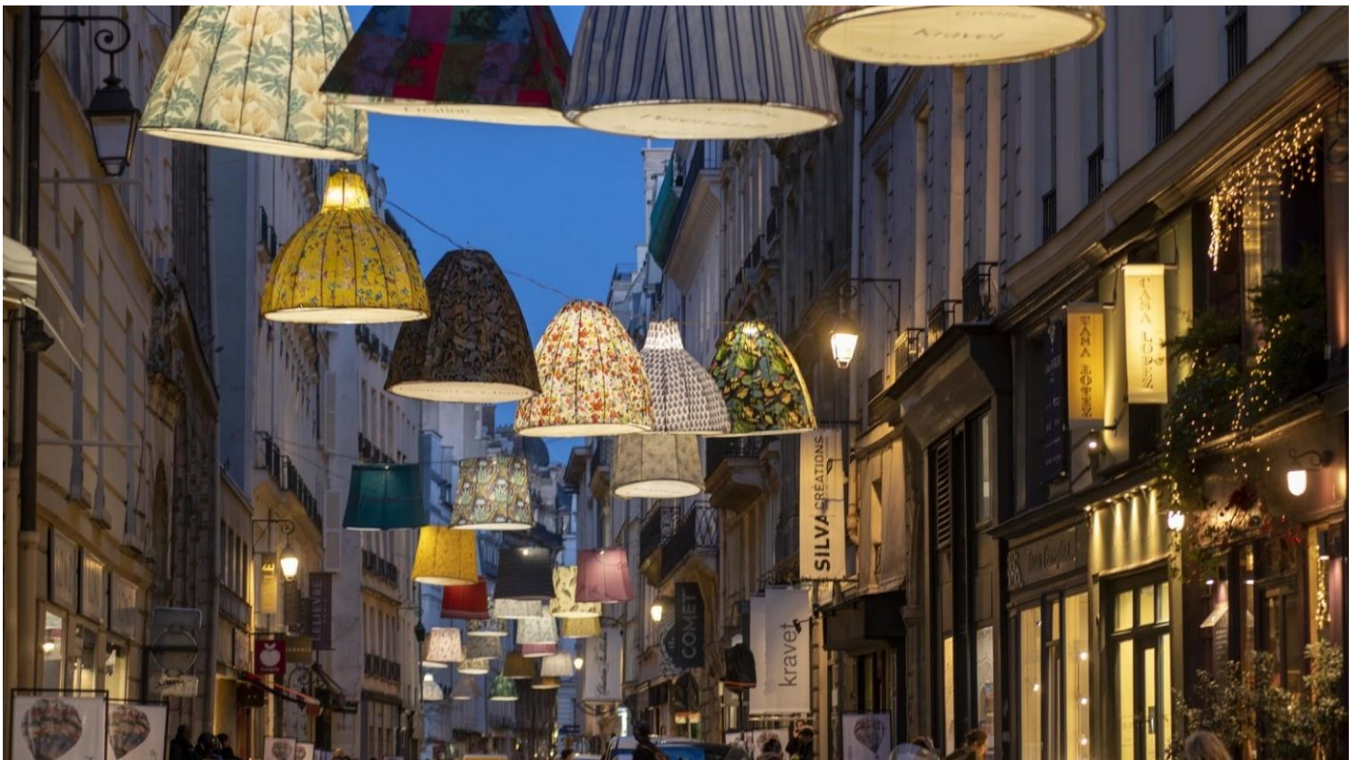
Paris Deco-Off